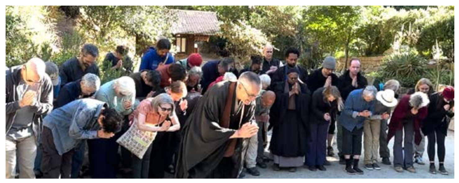
Students and teachers bowing to Tassajara residents for making the Intensive possible

Practicing dana becomes a way of realizing that "all life is interconnected."